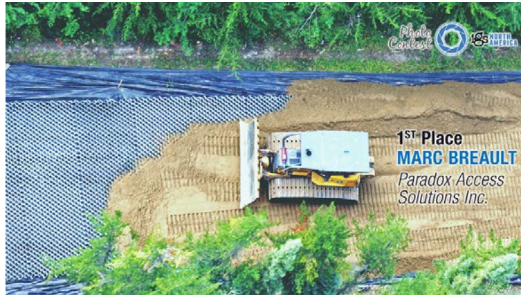
1 st - Marc Breault from Paradox Access Solutions Inc.

IGS-North America proudly announced the winners of its first ever photo contest during their General Assembly held at Geotechnical Frontiers 2017. The photo contest was open to all members of IGS North America and demonstrates geosynthetics in action.