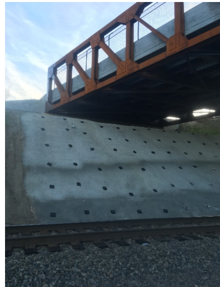
After reinforcement using Platipus Anchors