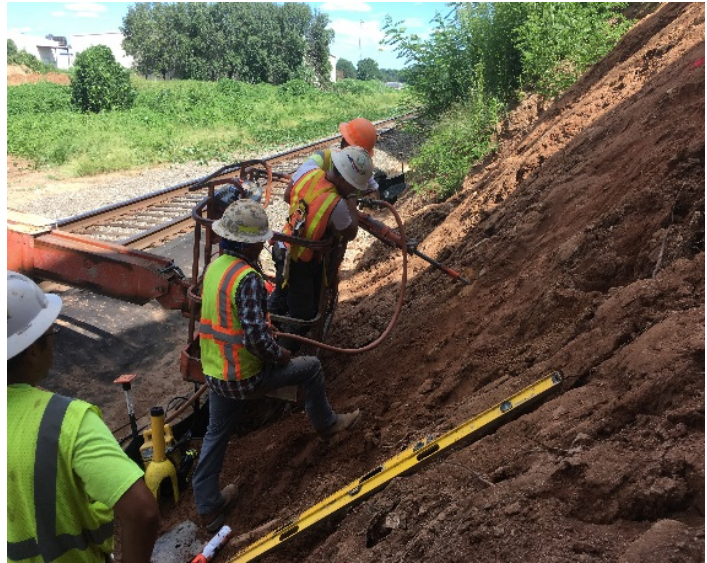
Anchor installation with a light hydraulic breaker.

To provide much needed access to two remote parking lots at Winston Salem State University, a bridge was built that will cross over an existing rail line and connect the lots to the main campus. The owner of the railroad, Norfolk Southern, would not allow the newly built bridge to be accessed until an adjacent abutment that had begun to slough was reinforced. The railroad felt there was a risk that the vibrations caused by passing trains could lead to a shallow plane failure.