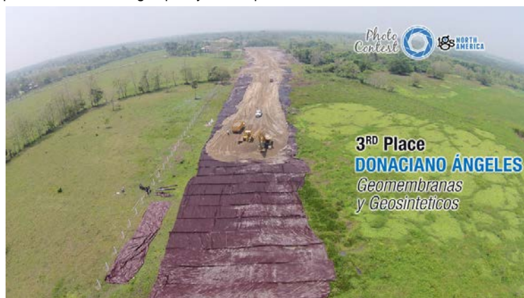
3 rd - Alfonso Narvázquez from Geomembranas y Geosintéticos, certificate accepted by Angel Diaz

Photo description: High scale separation using Mirafi® S1000M Non-Woven Geotextiles for the construction of the New Mexico City International Airport to improve the soil bearing capacity with imported bank materials over the area where the Texcoco Lake