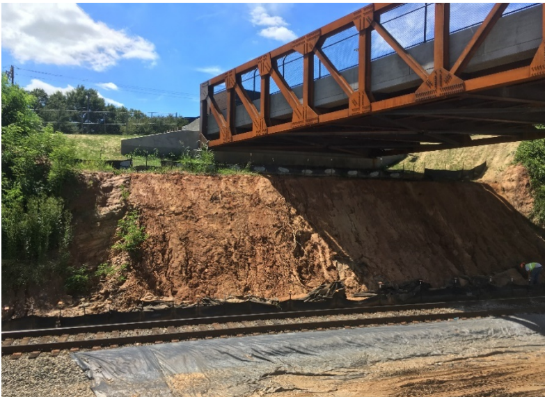
The slope before anchor installation

The Platipus ARGs® (Anchor Reinforced Grid Solution) system was specified by a local geotechnical engineer who was very experienced in the local geology of the Piedmont region. Summit Design and Engineering performed a slope stability analysis and concluded that the depth of failure was approximately 5 – 10 feet deep. The design included a grid pattern of 2 TN PDEA® (Percussive Driven Earth Anchors) being driven to a minimum depth of 15' and tensioned to 2,000 lb. working load. After all the anchors were installed, the slope was covered in a 4" thick, 4"x4" welded wire mesh reinforced concrete face. The load plates and wedge grips were post-tensioned to the concrete face after it had cured.