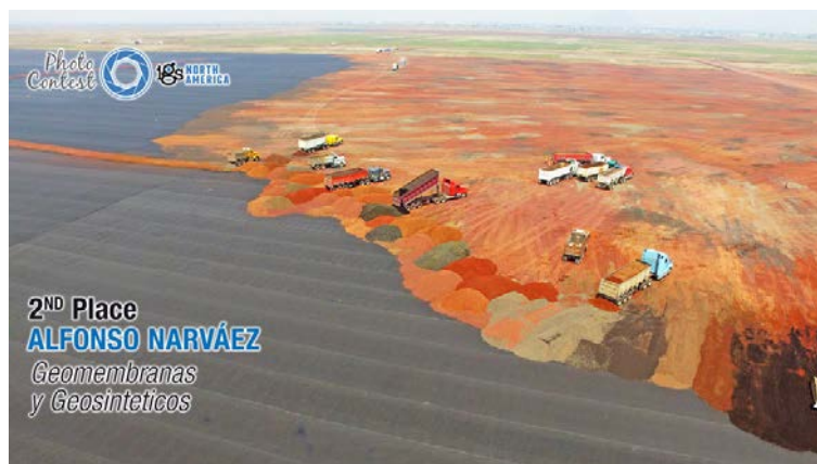
2 nd - Donaciano Ángeles from Geomembranas y Geosintéticos, certificate accepted by Angel Diaz

Photo description: Tough Cell are used on a Road Base with Sand Infill in a low CBR area. Location: Northern Alberta, Canada