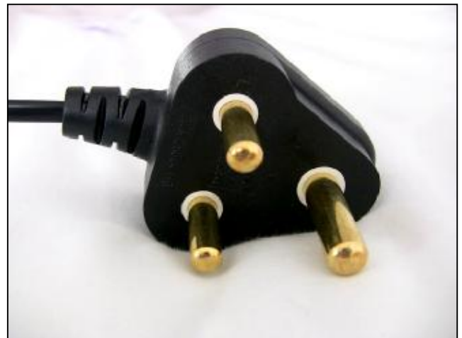
South African 220V Plug