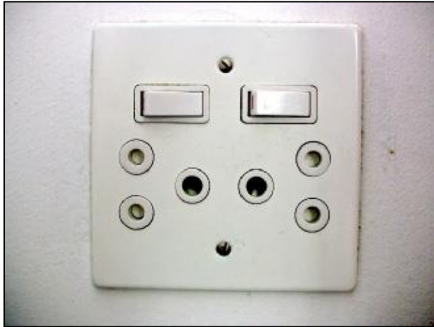
South African 220V wall outlet

South Africa is on the 220 Volt / 50-60 Hz standard, so if GeoAfrica delegates want to use their own computers / shavers etc they will have to bring along adaptors if they live in countries which use 110 Volt equipment. Many modern laptop chargers can work on a range of 100 – 240 V and 50-60 Hz – check yours before you come!